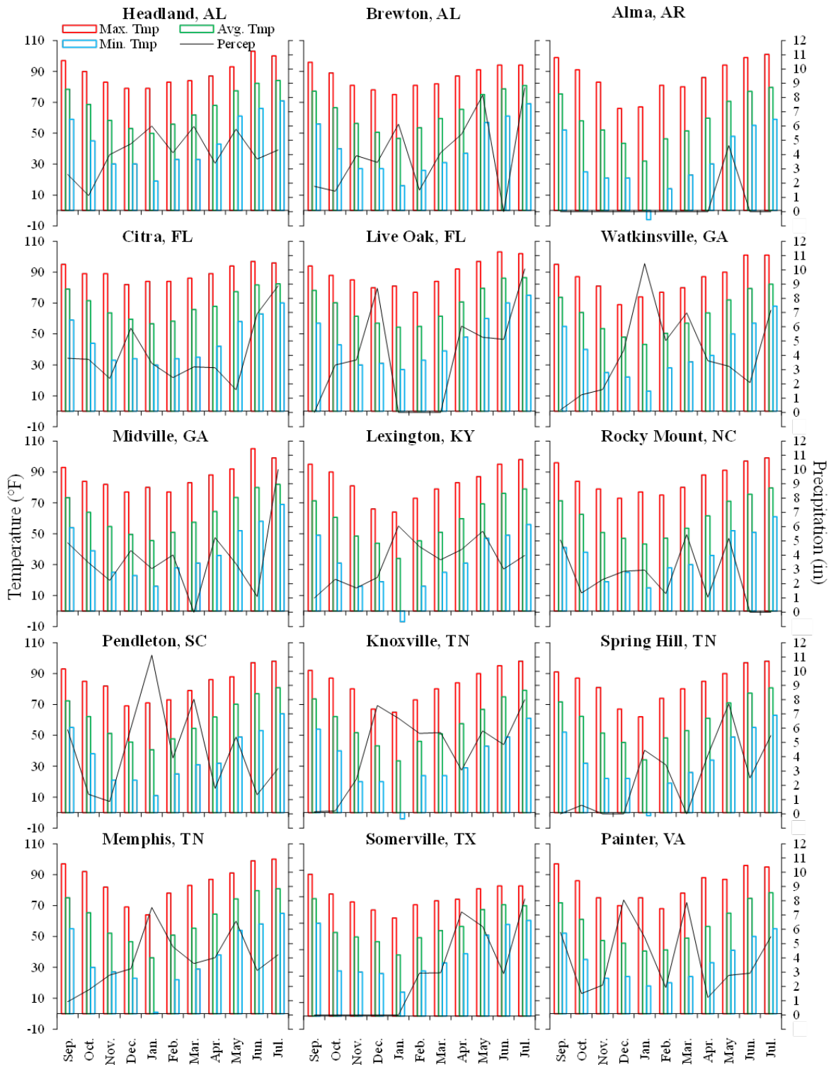
Figure 1. Temperature and precipitation averages by month across the cover crop growing season (Sept. 2023 – July 2024) for sites participating in the Southern Cover Crop Variety Trial.